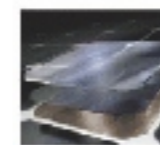
Solar panel High-efficiency monocrystalline panel High-efficiency monocrystalline panel