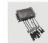
Solar Charge and Lighting Controller Smart MPPT charging system maintains battery and system life Optional Networking and Connectivity, Programmable lighting output for varied lighting needs