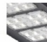
LED and Optics 100,000 hour L70 Rating High Output LEDs Wide range of color temperature options available Up to 210Lm/w